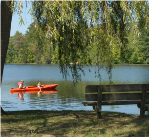
Canoe and Kayak Buhl Lake