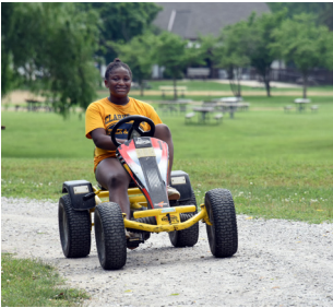
More than 20 miles of trails for hiking, biking and equestrians