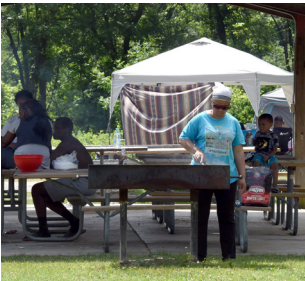
Picnic and pavilions