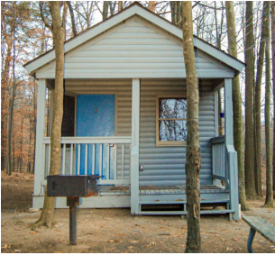
2-, 4- and 6-person cabins