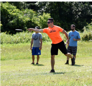
Disc Golf Course