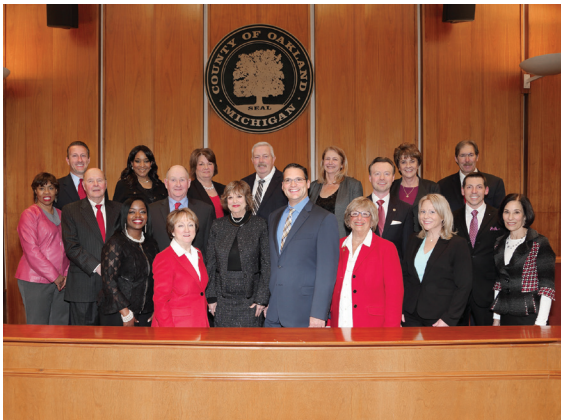
2019 OAKLAND COUNTY BOARD OF COMMISSIONERS