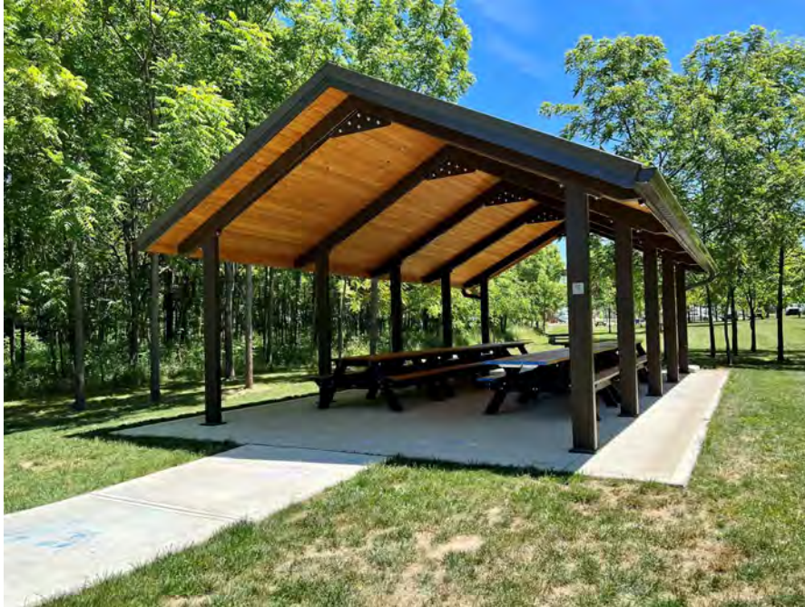
Refreshed and Refinished Pavilion