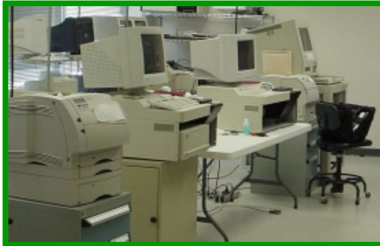
IDENTIX Training Room in Minnetonka, Minnesota

Our technicians traveled to the IDENTIX World Headquarters and received nine days of hands-on training in the state-of-the-art training facility. While at the facility, they were able to see firsthand some new technologies in Biometrics and talk with the engineers who are working to introduce these technologies to law enforcement.