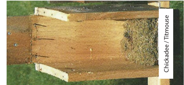
Chickadee / Titmouse