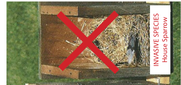
INVASIVE SPECIES House Sparrow