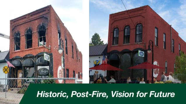
Historic, Post-Fire, Vision for Future

Oakland County Executive Office Building | Conference Center | 2100 Pontiac Lake Road | Waterford