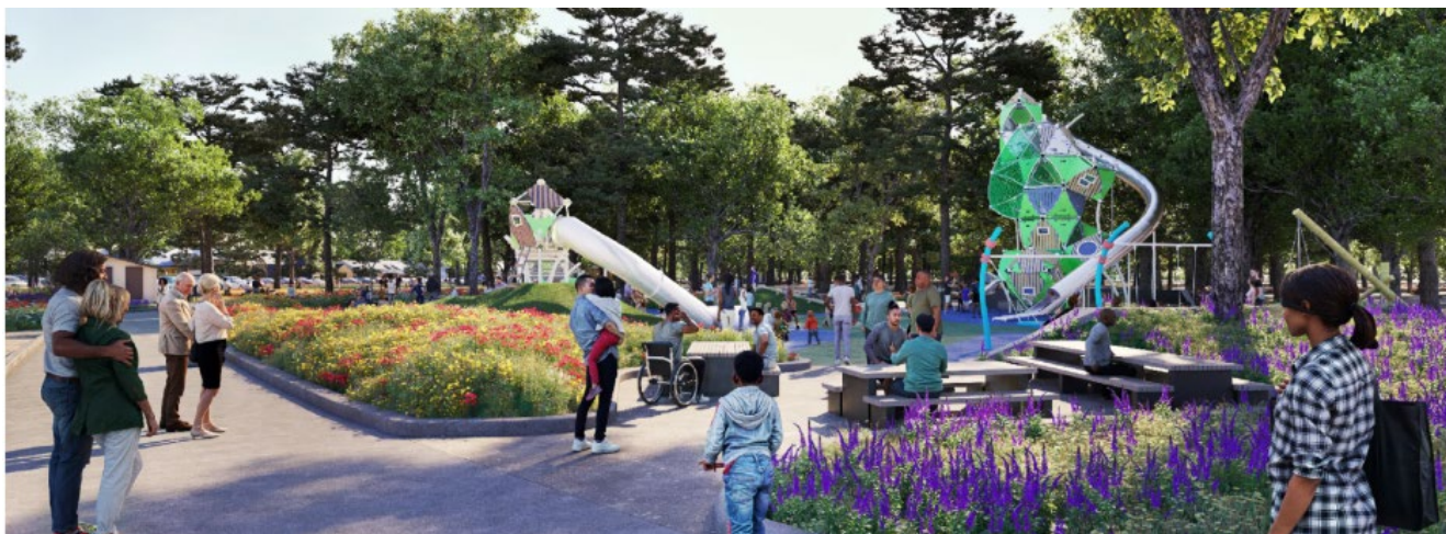
Figure: Rendering of the future Oak Park Woods at Shepherd Park