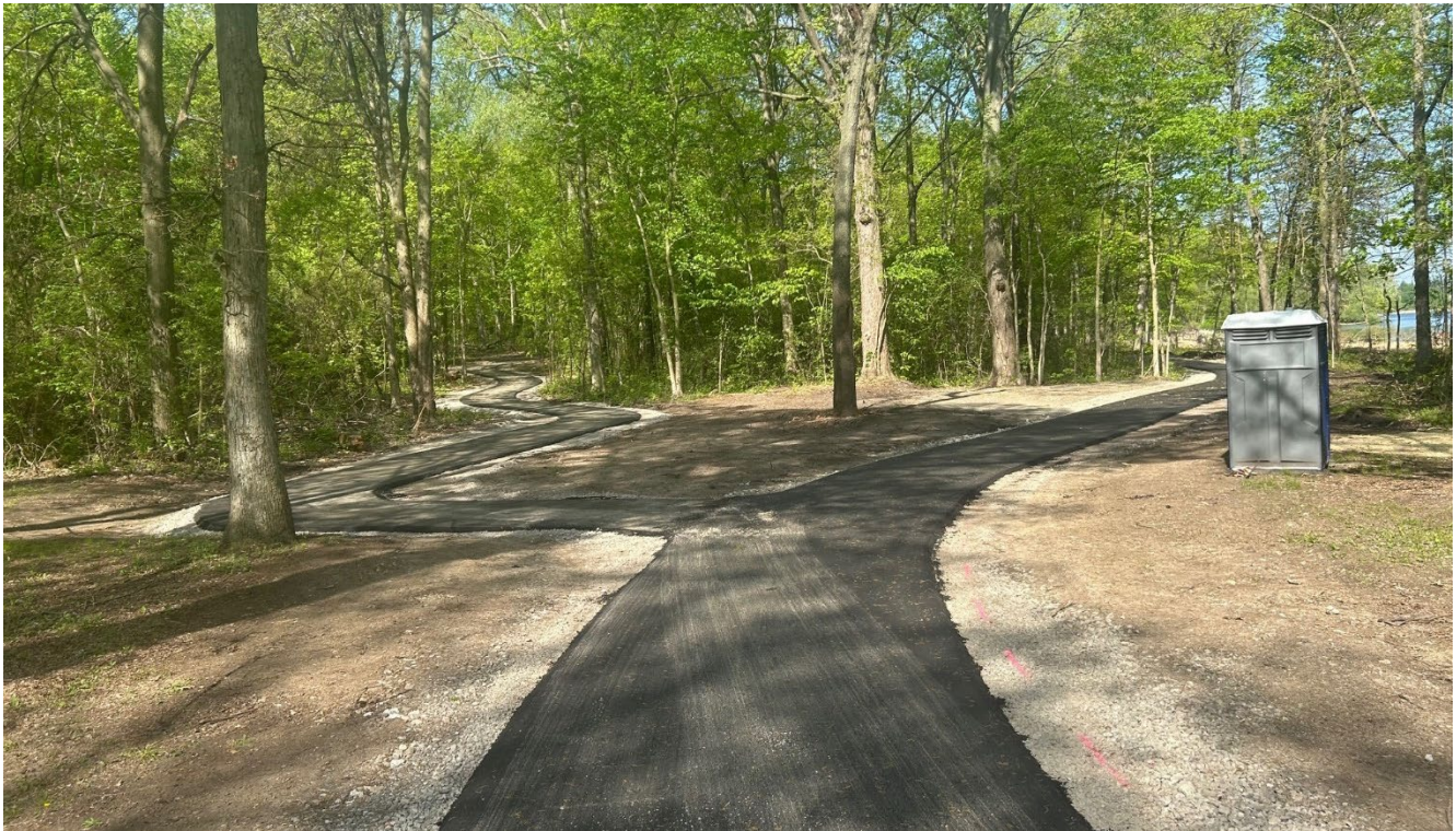
Photo: new paved trails at Pontiac Oaks County Park