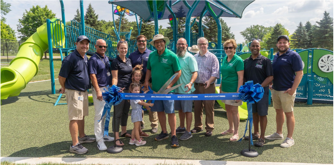
Photo: Grand Opening at inclusive playground at Lyon Oaks County Park on June 22, 2024