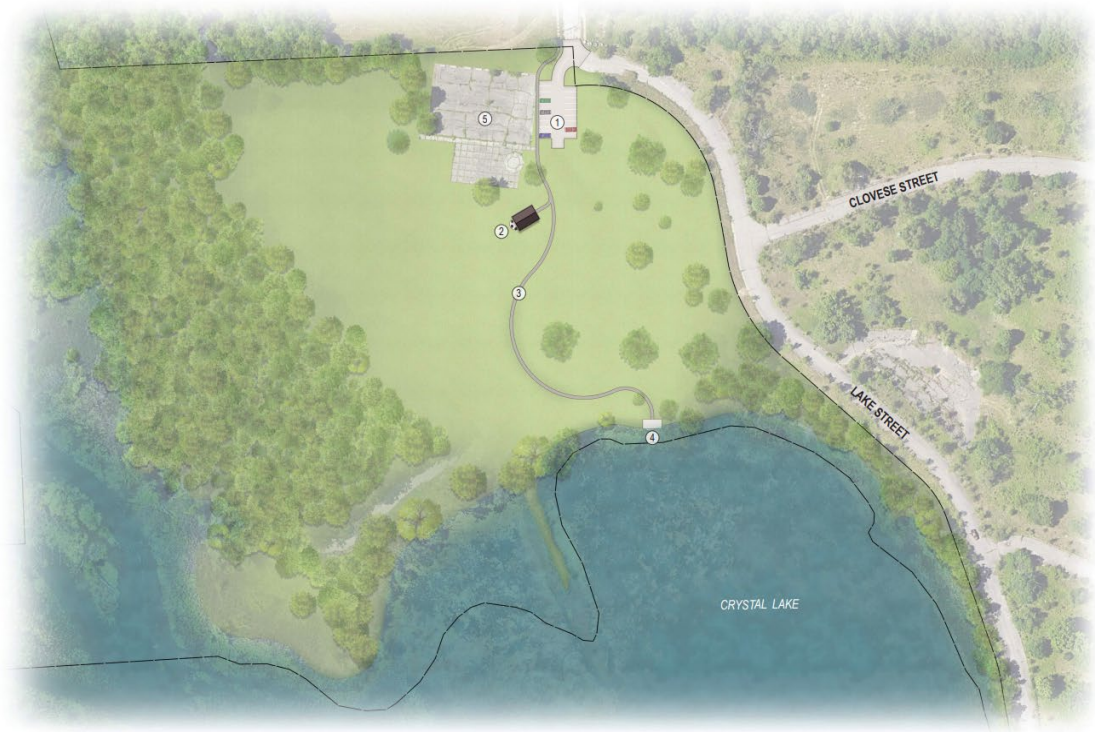
Photo: first phase master plan for Crystal Lake Park in Pontiac