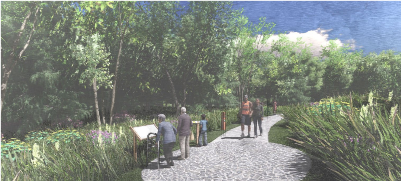
Figure: Southfield Oaks concept sketch