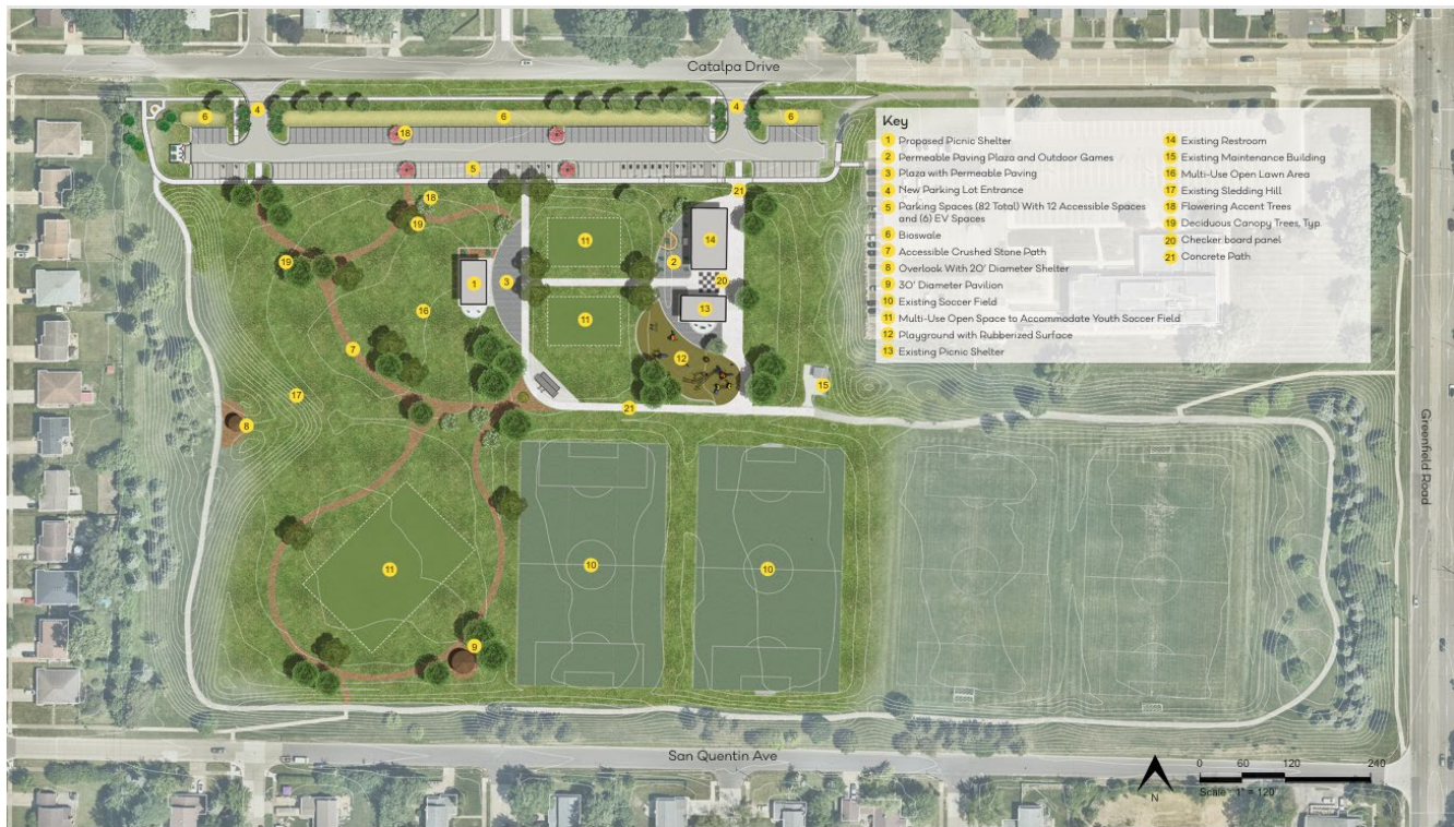
Figure: Schematic master plan for Catalpa Oaks