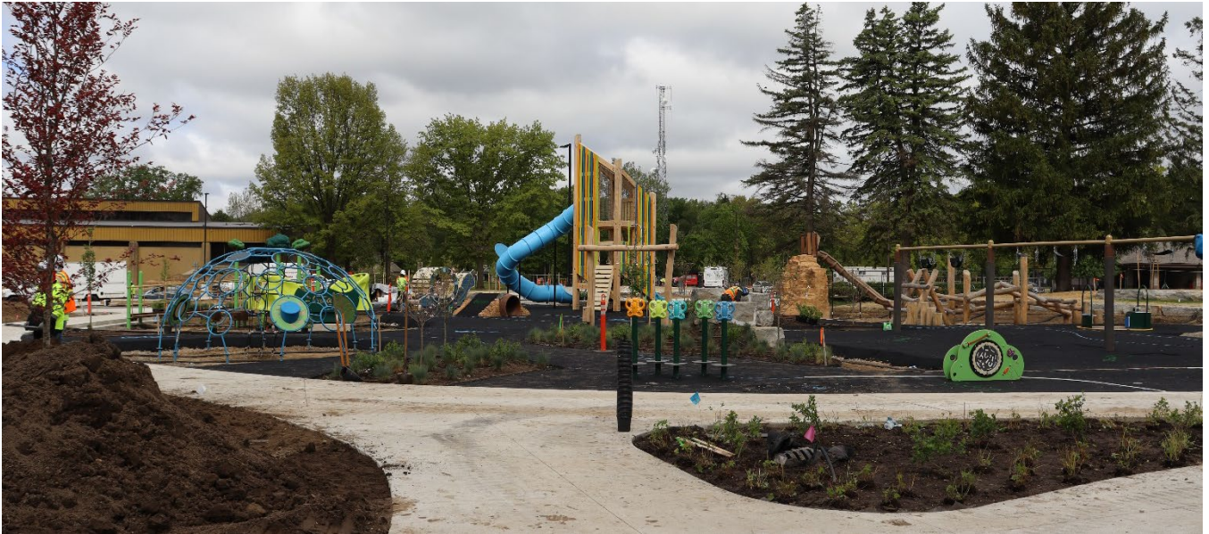
Figure: City of Southfield Beech Woods Park playground