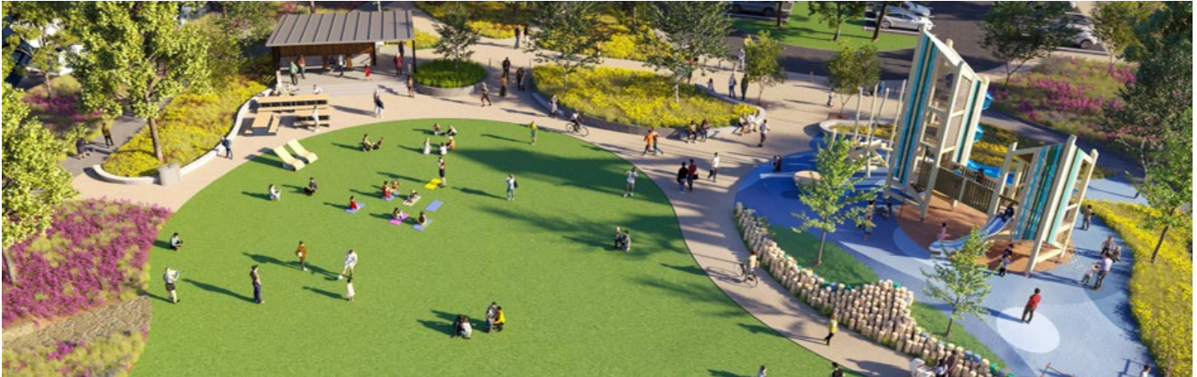
Figure: Red Oaks Play Garden rendering