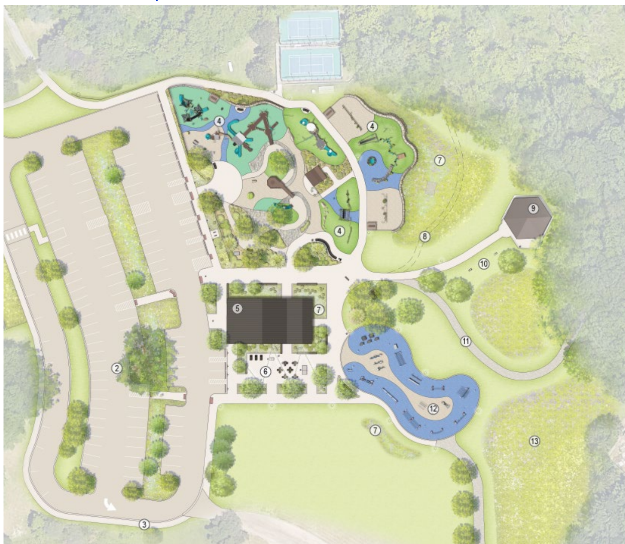
Figure: Waterford Oaks Renovation Master Plan