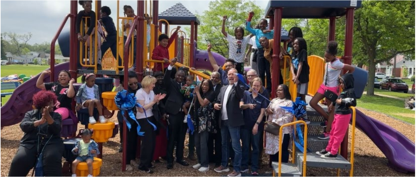
Photo: Grand Opening at new playground at Mack-Rowe Park on May 18, 2024