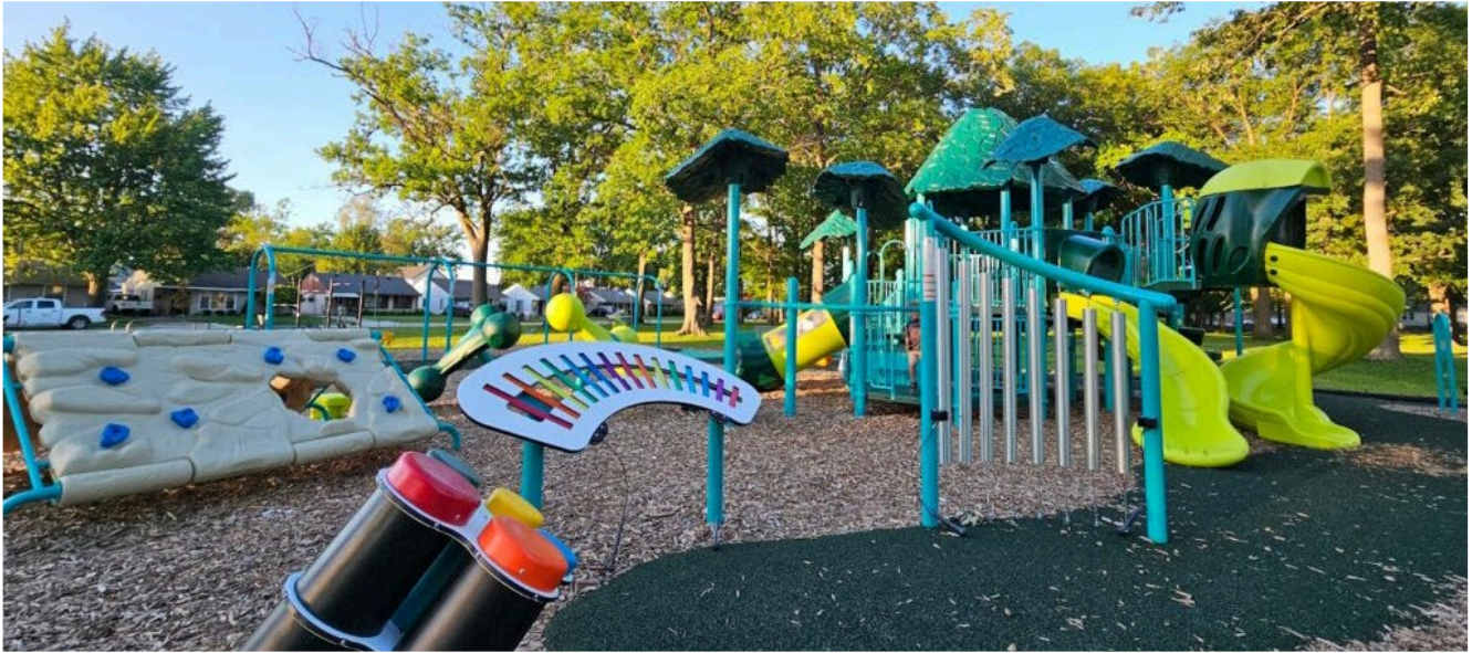
Photo: New accessible playground at Green Acres Park