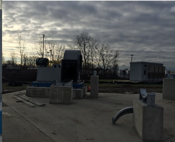
Installation of the odor control fans on vibration control bases and additional installation of biotrickling filter electrical conduit.