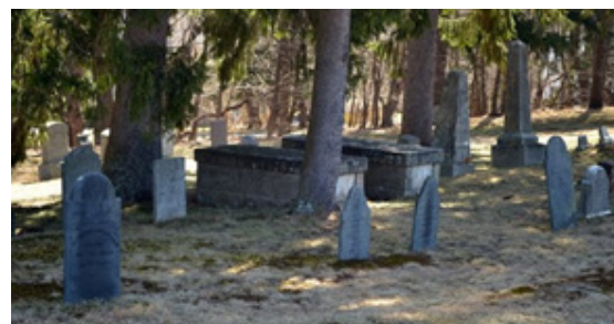
Union Cemetery, Amesbury, MA