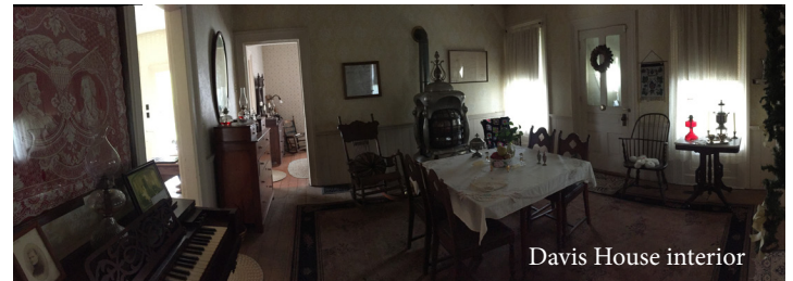
Davis House interior